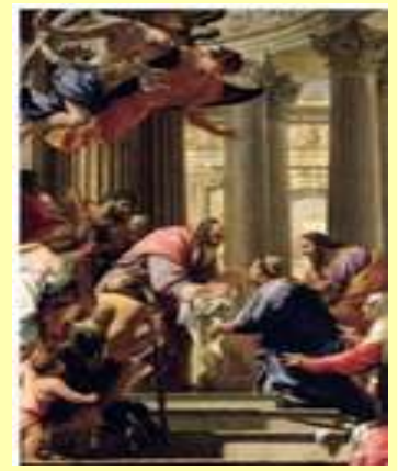
Presentation in the temple - by Simor Vouet c. 1640 (Chateau du Louvre)