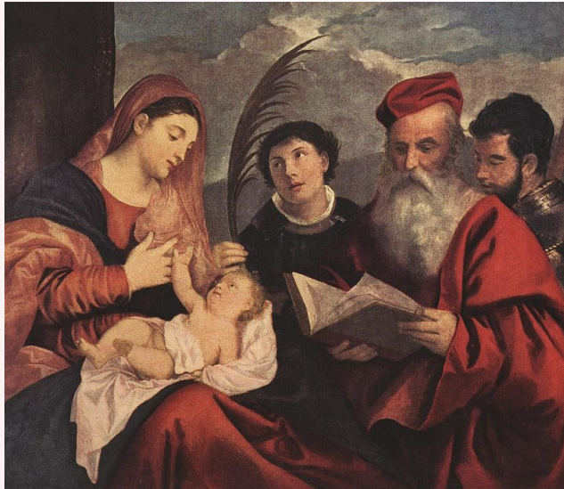
Mary with the Child and the Saints - by Titian C1510 - Musée du Louvre, Paris, France.

Have pity on those who love each other and are separated. Have pity on the lonely of heart. Have pity on the weakness of our faith. Have pity on the objects of our affection. Have pity on those who weep, those who pray; those who fear . . . Obtain for all hope and peace.