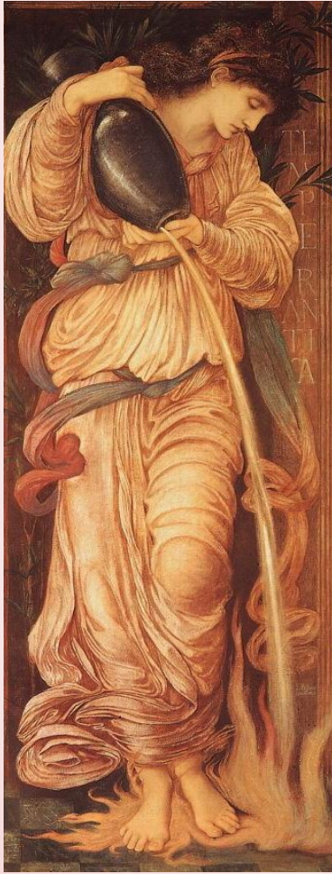
Temperantia (1872-1) by Edward Burne-Jones

“When you do not receive communion and you do not attend Mass, you can make a spiritual communion, which is a most beneficial practice; by it the love of God will be greatly impressed on you”. (St Teresa of Jesus)