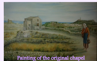
Painting of the original chapel