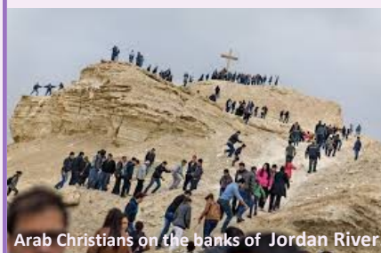
Arab Christians on the banks of Jordan River.

This demands a permanent commitment to think like him, to judge like him and to live as he lived. Contd... page 4